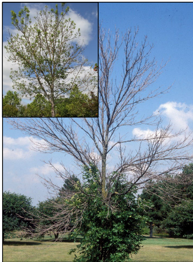
Dead canopy and epicormic shoots of tree with severe decline caused by EAB. Inset: Infested ash tree at the initial detection site in Forest Grove, Oregon. Note the thinning canopy.

EAB is more often detected by keen eyes than by traps. In 2015, Oregon Department of Forestry, with financial aid from U.S. Forest Service and in conjunction with Oregon State University Extension, Oregon Department of Agriculture and the USDA Animal and Plant Health Inspection Service, developed a program to train over 500 of Oregon’s natural resource specialists from local and state agencies on how to detect and report EAB and other invasive pests. Read