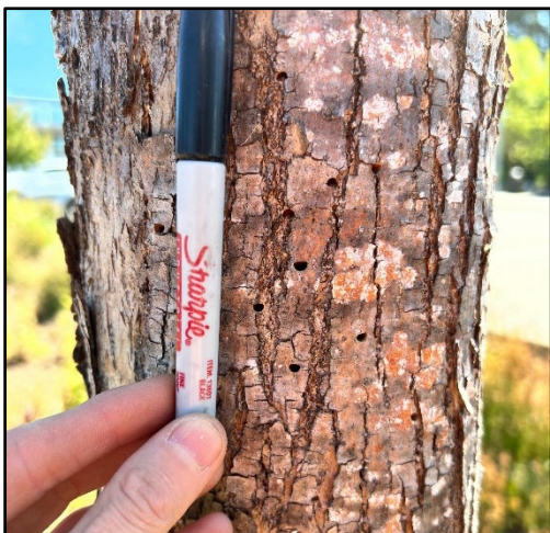
“D-shaped” exit holes from EAB adults. C. Buhl.

feeding on the vascular cambium. Second, the adults in this group of beetles leave a characteristic “D-shape” exit hole about an eighth of an inch wide when exiting the tree. Last, after about three or four years of repeated attack and feeding by EAB, ash trees show significant