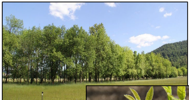
Oregon ash in a small riparian system near Marcola, Oregon. W. Williams.

Oregon ash is known from research trials to be highly susceptible to EAB. Oregon ash is a key part of riparian forests and wetlands west of the Cascades. It grows along streams, rivers and wetlands below 2,000’ elevation, with 80 percent of the species occurring below 1,000’ elevation. At the lowest elevations (below 500’) it forms pockets of pure stands. EAB is