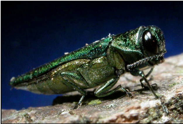
EAB adult. D. Cappaert.