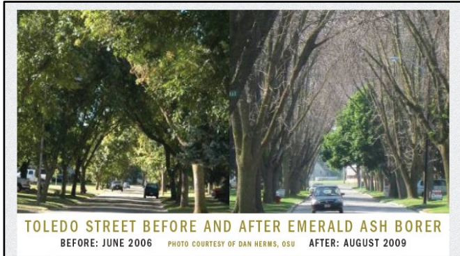
Street trees, before and after EAB, Toledo, Ohio. EAB can move through an entire community in 3-10 years. D. Herms.

Graduates of the Pest Detector program and any member of the public can report a suspected ash tree through the online reporting tool at https://oregoninvasiveshotline.org/ .