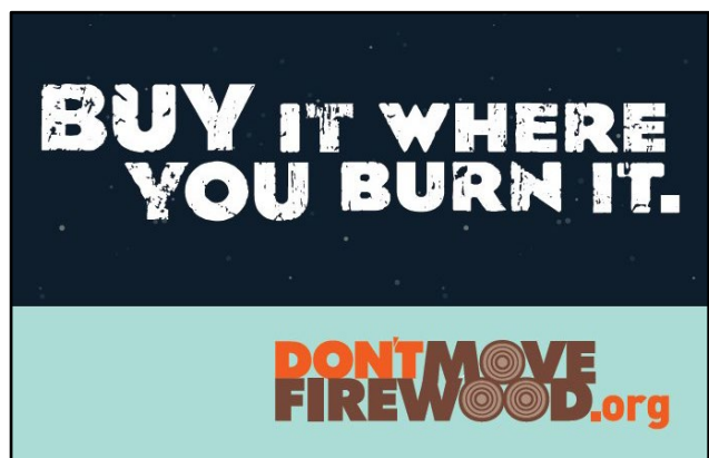
Ash firewood should not be moved. Campers should buy kiln-dried firewood at campgrounds.

Other management options include pre-emptive removal of ash near an active infestation. Municipalities are encouraged to inventory ash trees and have a plan to spread the cost of ash tree removal over several years. Once removed, ash trees should be chipped to pieces one inch in dimension to stop the growth of EAB insects inside the tree. The chips should be covered with thick plastic or buried to stop the spread of EAB adults that may still emerge. Ash is a wonderful firewood but is also a prime pathway for the insect to move across the state. Therefore, ash firewood that is recently cut and split should also be covered by thick plastic for at least one year. Firewood should not be moved more than 30 miles from where it was harvested. See https://www.dontmovefirewood.org/ .