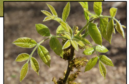
Oregon ash ( F. latifolia ) with male flowers. W. Williams.

capable of killing entire stands of these ash. Oregon ash occurs on both lands zoned for forestry and for agriculture. Oregon ash is widely used for stream restoration plantings due to its ability to stabilize soil, control sediment, and moderate stream temperatures. It is assumed that widespread death of Oregon ash will lead to ecological changes in water quality, stream temperatures and riparian plant communities. Oregon ash has limited use in Oregon as a timber species. However, a number of small specialty mills process this hardwood for woodworking.