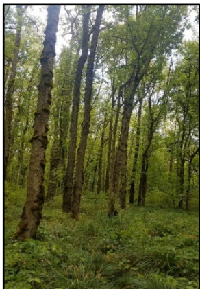
Stand of pure ash is home to elk and other wildlife species. Ankeny National Wildlife Refuge.

Because the threat of EAB has been known for some time, Oregon has led the effort among states on the West Coast to prepare for this destructive pest. With financial assistance from the U.S. Forest Service State and Private Forestry program, ODF is collecting 1 million seeds of Oregon ash from across its range in Oregon. The seeds are being sent to researchers at USDA Genetic Resource Center near Cottage Grove, Oregon, as well as the USDA Seed Lab in Fort Collins, Colorado. Seeds were collected following a protocol that is designed to capture the genetic diversity of Oregon ash in the state. The hope is that one day there will be tree breeding programs to develop Oregon ash that is resistant to EAB and restore affected areas. The seed collection will provide genetic material to start the breeding program.