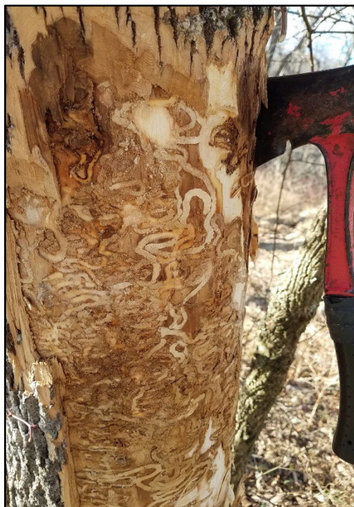
Serpentine galleries caused by larval EAB feeding. W. Williams.

There are certain signs and symptoms that are characteristic of EAB, most of which are very long lasting, well after the insect has completed its development and left the tree. If the bark of affected trees are removed, one can observe the meandering “serpentine-shaped” galleries caused by hundreds and even thousands of larvae